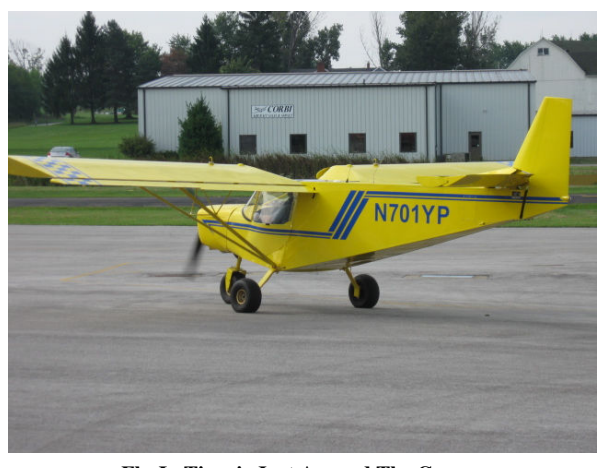
Fly-In Time is Just Around The Corner

Spring has Sprung!!! All right, maybe not like anyone can tell, but the calendar says so.... Anyway, the monthly NCLF meetings are starting up again and that is a good sign. Attend the opening of the 2011 season and think warm thoughts.